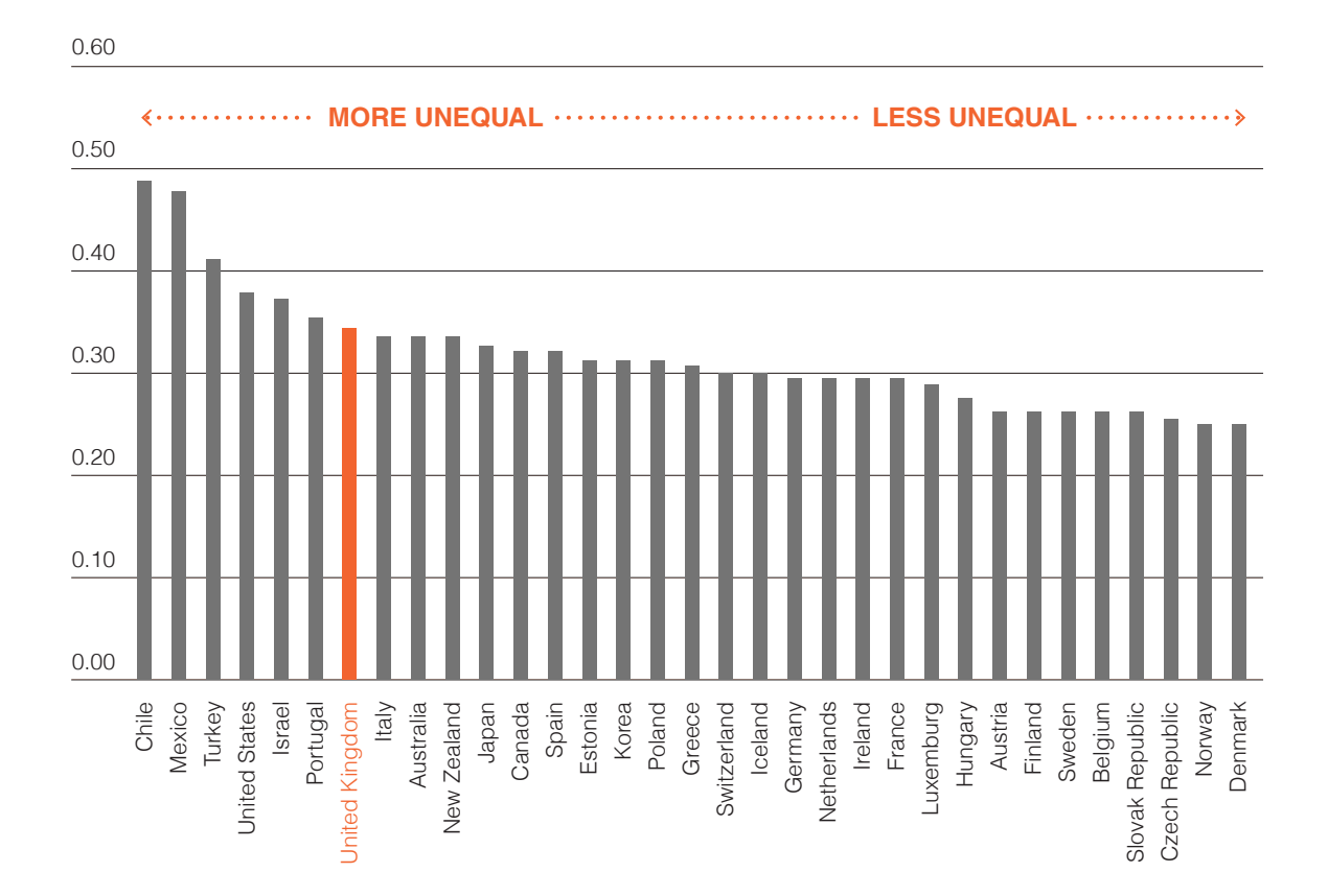
figure 1 OECD countries ranked by income inequality (measured using the Gini coefficient)

<sup>1</sup> OECD, Factbook 2011-2012: Economic, Environmental and Social Statistics via http:// www.oecd-ilibrary.org/ sites/factbook-2011en/03/05/01/index. html?itemId=/content/ chapter/factbook-2011-31-en%20 <sup>2</sup> Institute for Fiscal Studies, Better-off hit hardest by recession initially; poor feeling the squeeze now. 4 June 2013 via http://www.ifs. org.uk/pr/inequality_recession_june2013.pdf